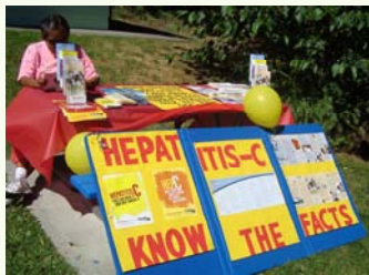
Above, a lady learning about the disease at an information table.

The group reported that about 60 people were served. There were hamburgers, hotdogs and veggie burgers, along with salads and munchies. [Editor: But were there any Nanaimo bars?]