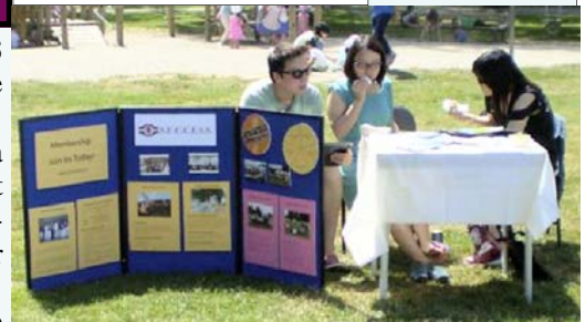
S.U.C.C.E.S.S. Society's information table