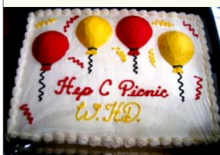
A World Hepatitis Day 2013 cake greeted friends at awareness event in Nanaimo!

One of the organizers noted that a lot of people who came were both hungry and curious. They came, ate, and left with some info about Hep C. How wonderful that they could receive information about this disease!